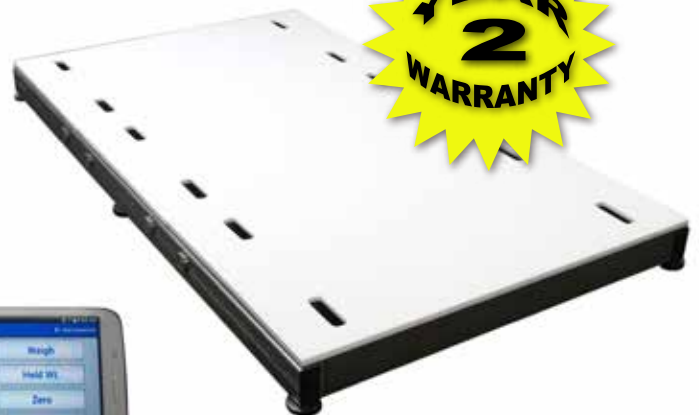
SR®V714 Mobile Platform Scale shown with tablet for readout