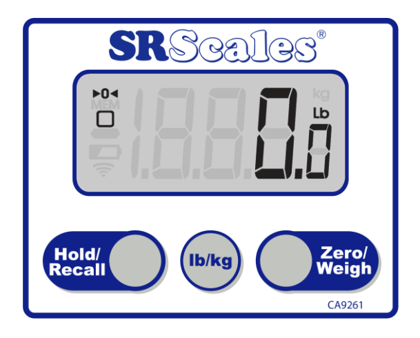
Figure 2: SRV415 Button Label