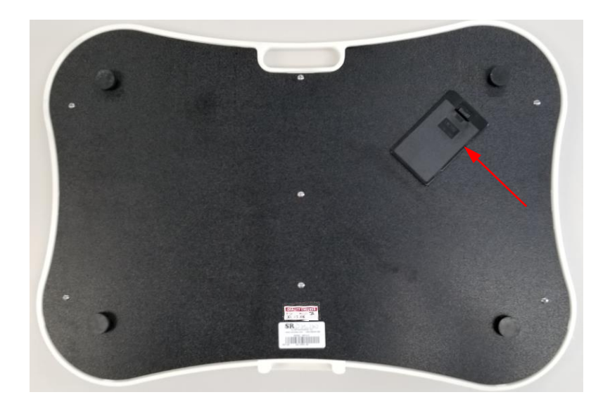
Figure 1: SRV415 Battery Installation

NOTE: Scale should not be placed on carpet or uneven floor surfaces as this may interfere with scale accuracy.