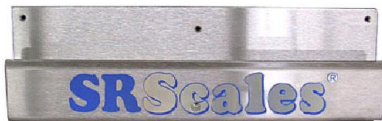
Figure 1: Wall Hanger