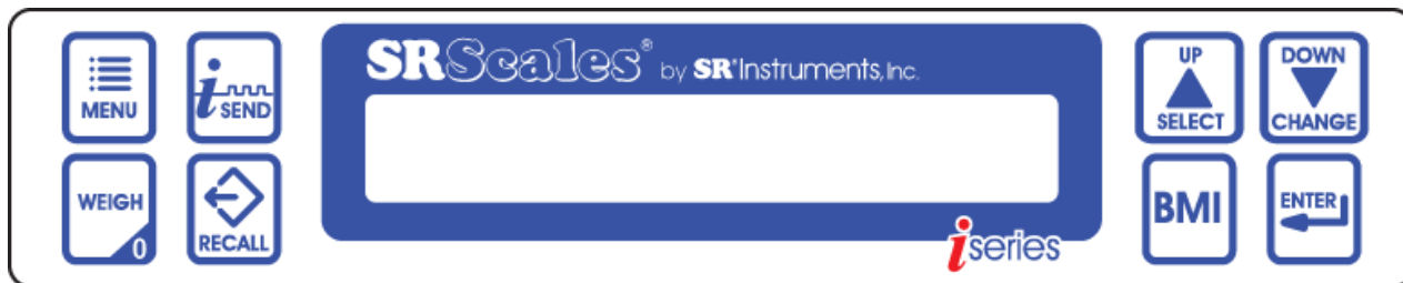
Figure 2: Button Display