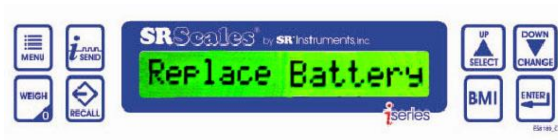
Figure 3: “Replace Battery” Display

STEP 1: The display will read “ REPLACE BATTERY ” (Figure 3)