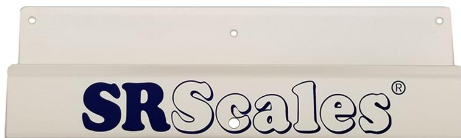
Figure 1: Wall Hanger