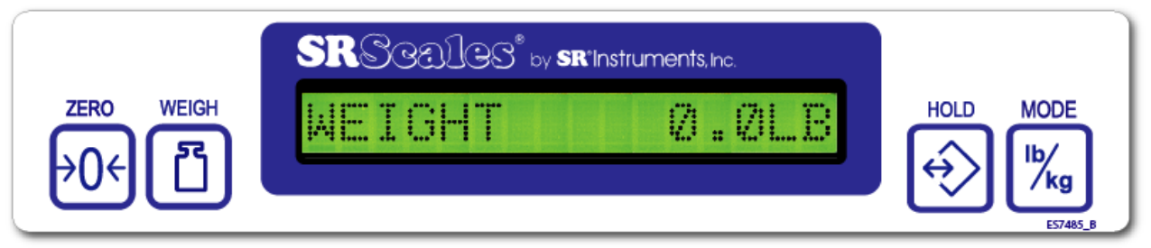
Figure 3: SRV711 Display Label