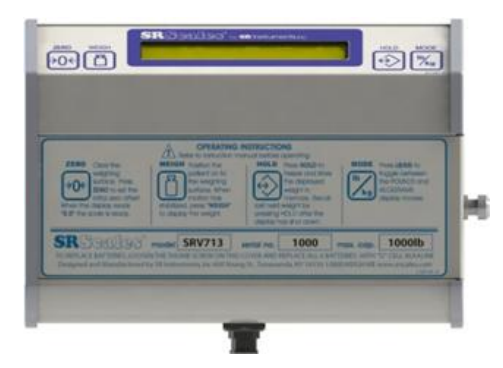
Figure 1: Display

STEP 4 : Carefully lower the Scale Platform to the floor making sure not to crimp the Display Cable (3). Note : If it is run through conduit, pull any slack in the cable up through the Conduit.