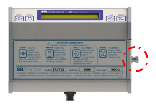
Figure 4: Battery Compartment Cover and Screw