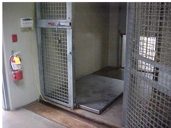
Figure 2: Example Zoological Application

STEP 5 : (Figure 1) Mount the Display on the wall at desired height and location by mounting two screws to the wall and mating the mounting bracket on the back of the display to the screws on the wall.