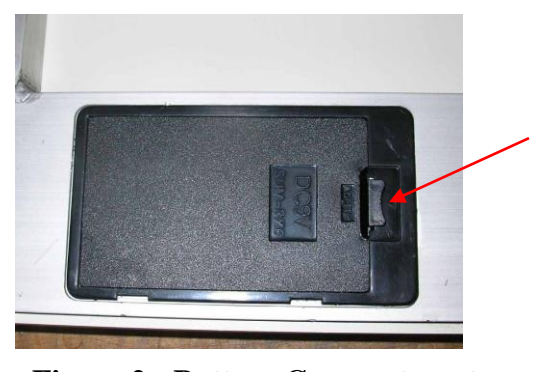
Figure 2: Battery Compartment

STEP 3 : Replace Battery Compartment cover.