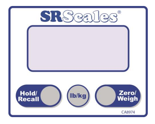
Figure 7: Calibration Button (Underside of Display Board)