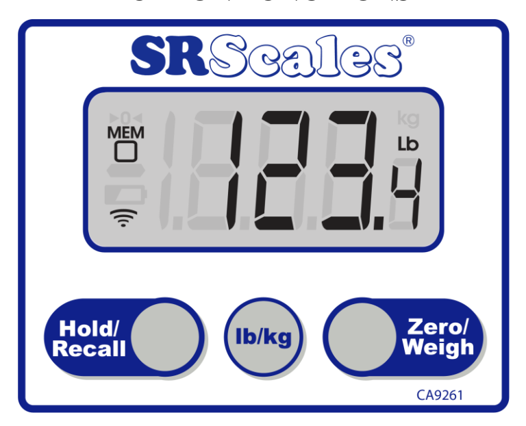
Figure 3: Button Display