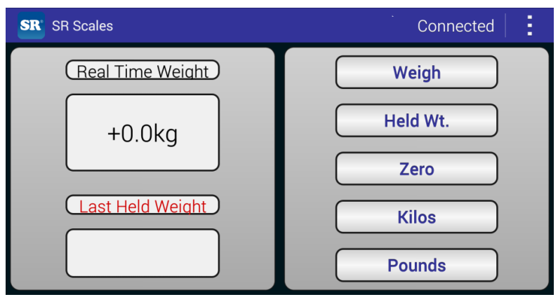
Figure 5: Button Functions

The " POUNDS " button allows weight data to be viewed in pounds, displayed in a resolution of 0.2 pounds.