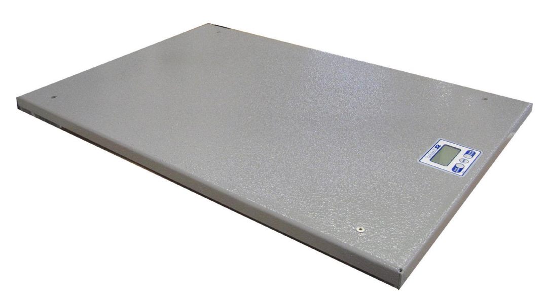
Figure 1: Assembled SRV949-BT

To install included six (6) AA 1.5-volt alkaline batteries, follow steps below: